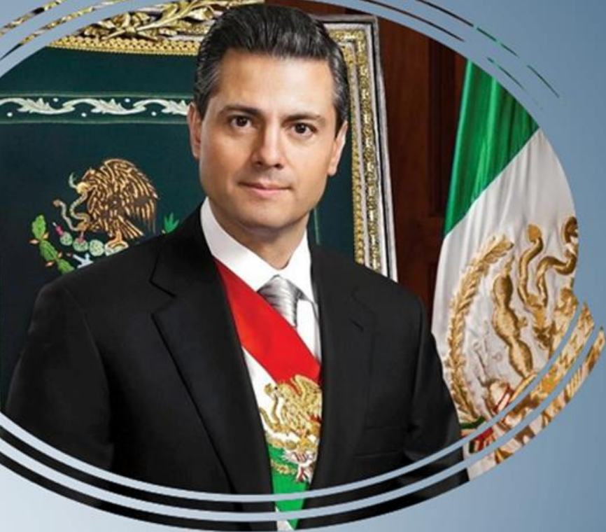
Enrique Peña Nieto Former President of México (2012-2018)